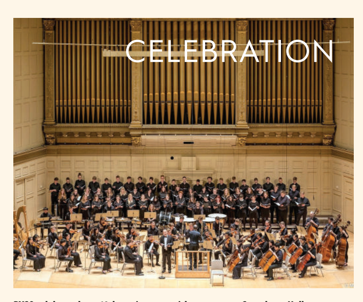
BYSO celebrated our 60th anniversary with a concert at Symphony Hall on APRIL 29, 2018, featuring visiting youth choirs from Leipzig, Germany. The performance included a special archival exhibit, commemorating our partnership work with the Boston Symphony Orchestra (BSO) as well as our deep roots in the city of Boston and the world of classical music.