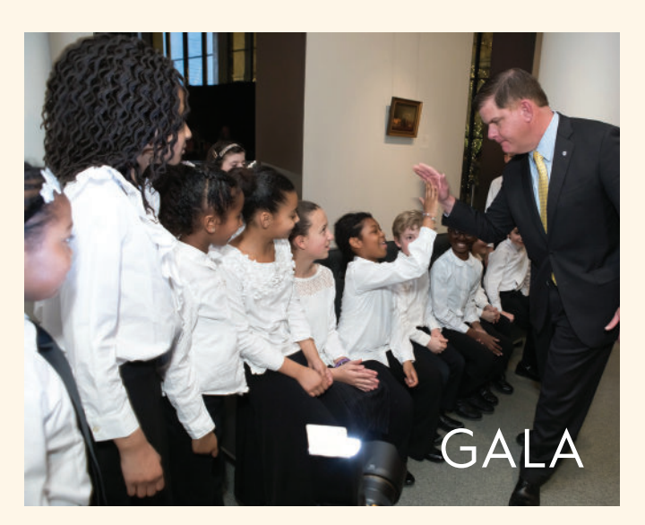
On MARCH 10, 2018, we welcomed nearly 300 guests to Boston's Museum of Fine Arts for our 8th Annual Gala celebrating BYSO's 60 years of impact. During the evening we honored distinguished alumni, supporters, and community leaders including Boston's Mayor Martin J. Walsh. The event raised nearly $350,000 to support BYSO's students and families.