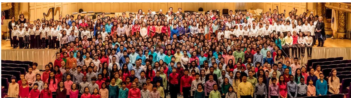
All 500 BYSO students in Symphony Hall, Boston.

***Advertisers will also have the opportunity this season to advertise in an additional spring concert program – more information coming soon!***