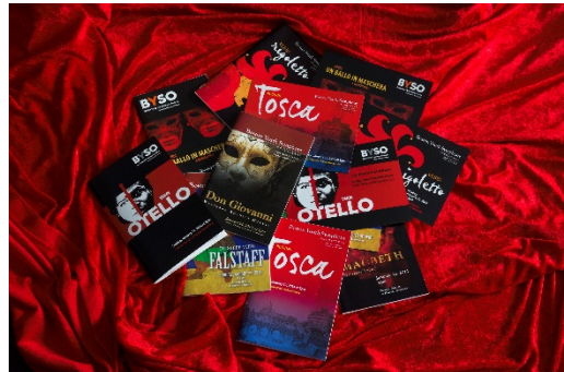
Left, curtain call at BYSO's annual sold-out opera. Right, opera program books through the years.